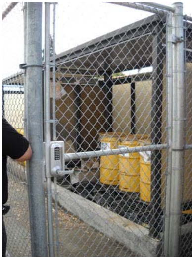
Secured gate entrance to enclosure