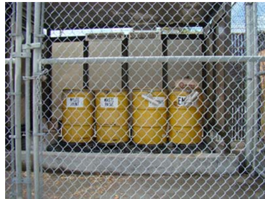
Labeled barrels inside secured fence