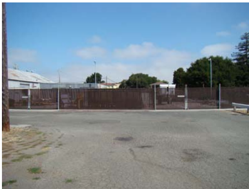
Front view of Hazardous Waste Site

Solano County Department of Resource Management Solano County Board of Supervisors Solano County Sheriff/Coroner's Office Napa County Administrator Napa County Grand Jury California Environmental Protection Agency