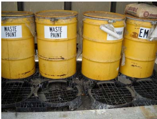
Appropriately labeled barrels