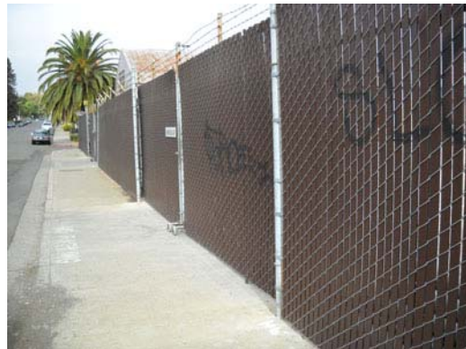
Secured perimeter fence on the North sidewalk of Virginia Street looking west