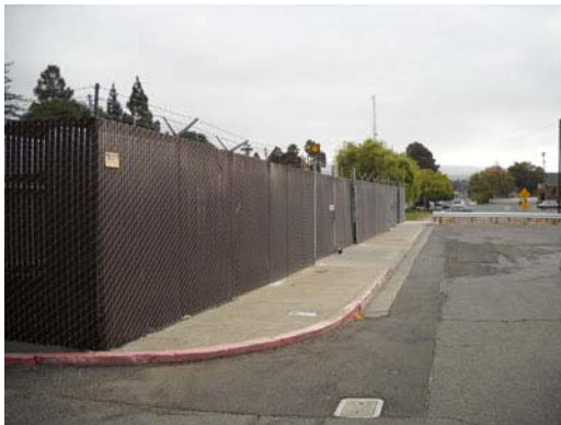
Secured perimeter fence on the North sidewalk of Virginia Street looking East